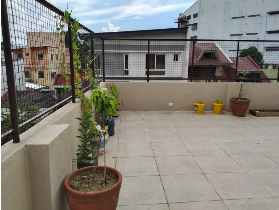
The current roof deck will become the second floor of the REACH national headquarters.

Our faith journey towards building a home for REACH after more than four decades of renting saw the construction of a one-story with mezzanine structure. This was phase one of the proposed multistory REACH national headquarters and accomplished by God's grace at the height of the global pandemic in 2020.