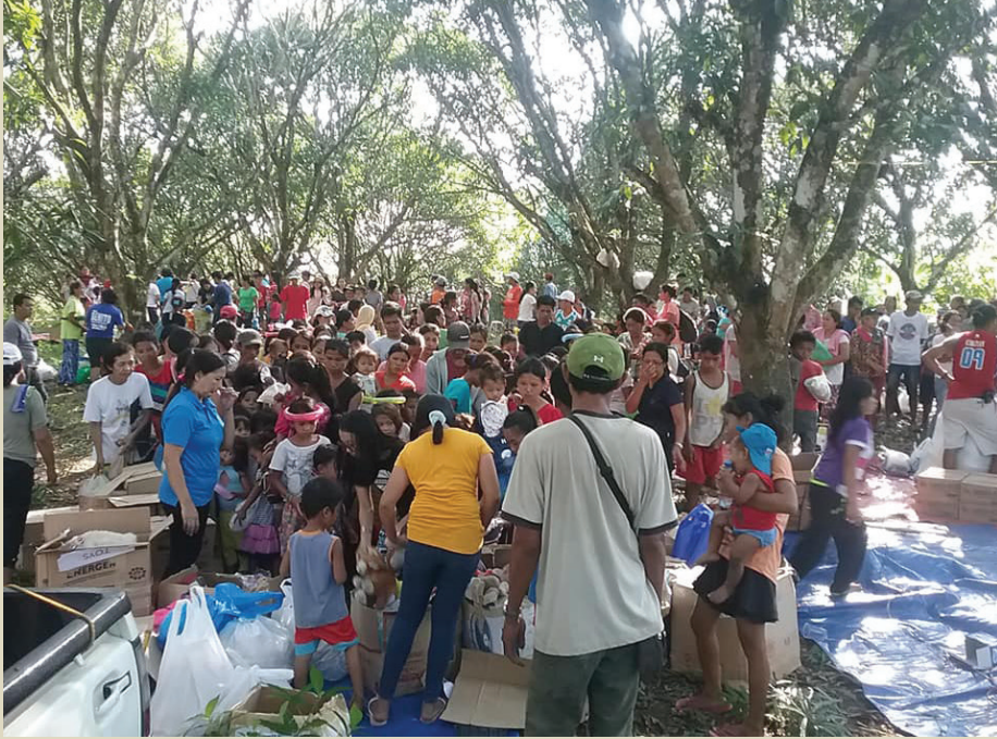
Relief goods were distributed to around 280 families under the trees in a Tulunan barangay affected by the recent series of earthquakes.