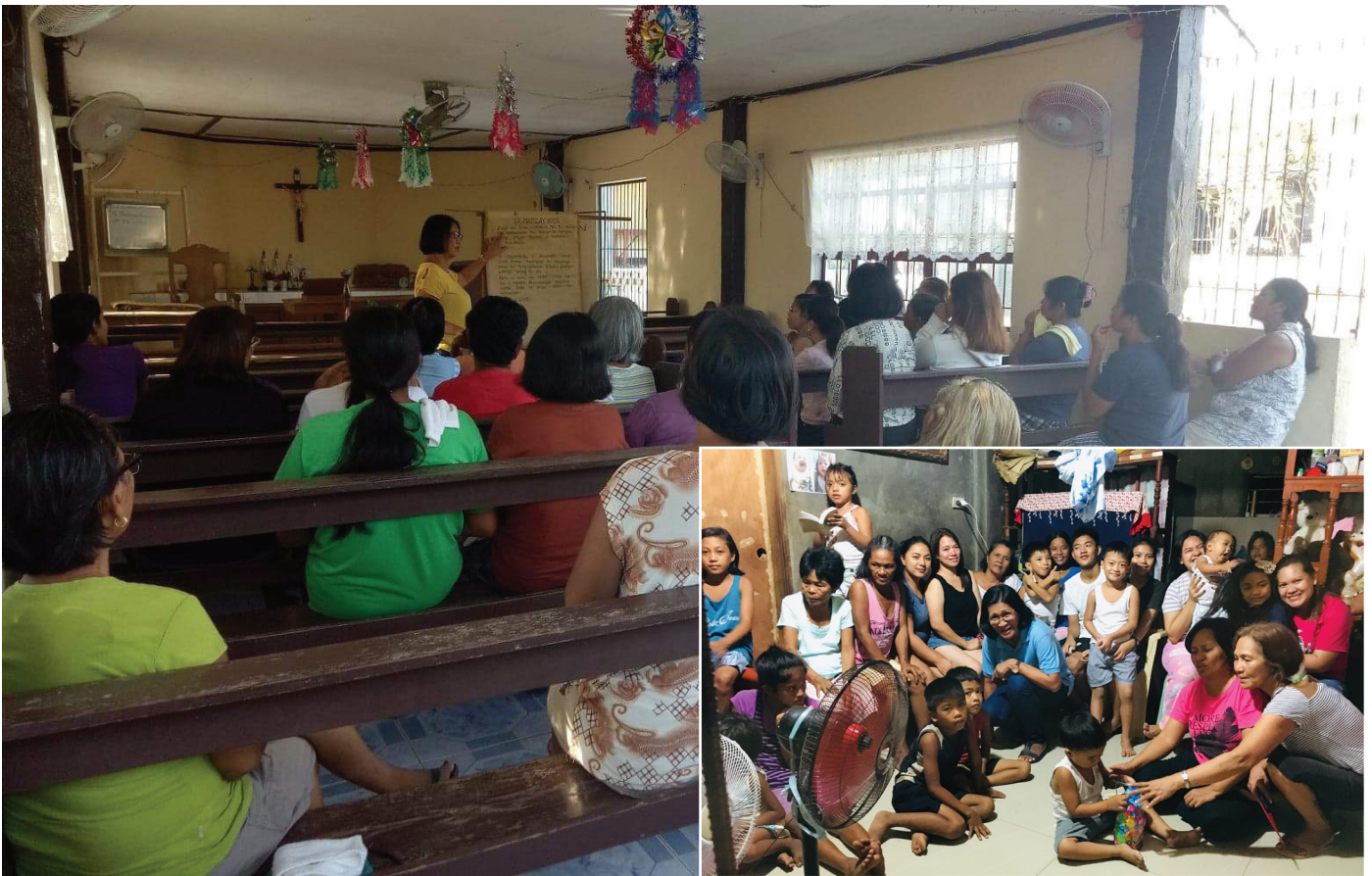
(Large photo) Evangelism at Pilig Alto, Cabagan, Isabela in November 2018. (Corner photo) Regular attenders of a weekly Bible study and fellowship in barangay Catabayungan, Cabagan, Isabela.