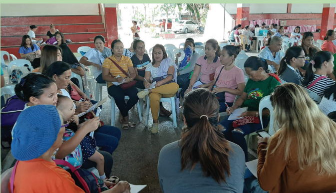
The workshop allowed parents to evaluate their parenting skills and learn how to do better.