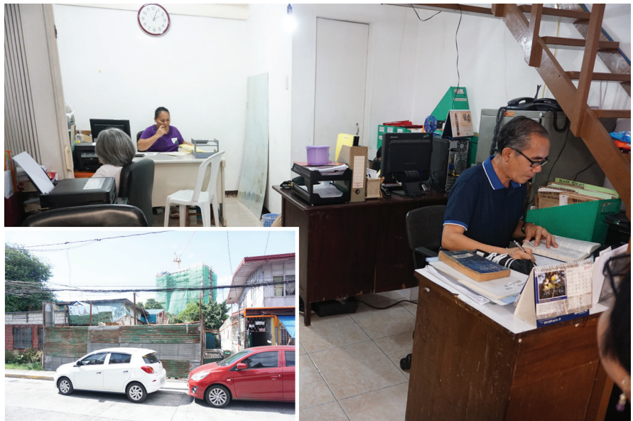
The REACH office transferred to the apartment adjacent to the REACH Ministry Center at 23 Lanzones St. Once a building permit is released, construction will begin at 7 Bignay St. for the new national facility.

Those convicted to give to the Building Fund may make one-time