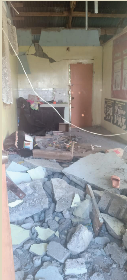
Homes and municipal structures were destroyed.